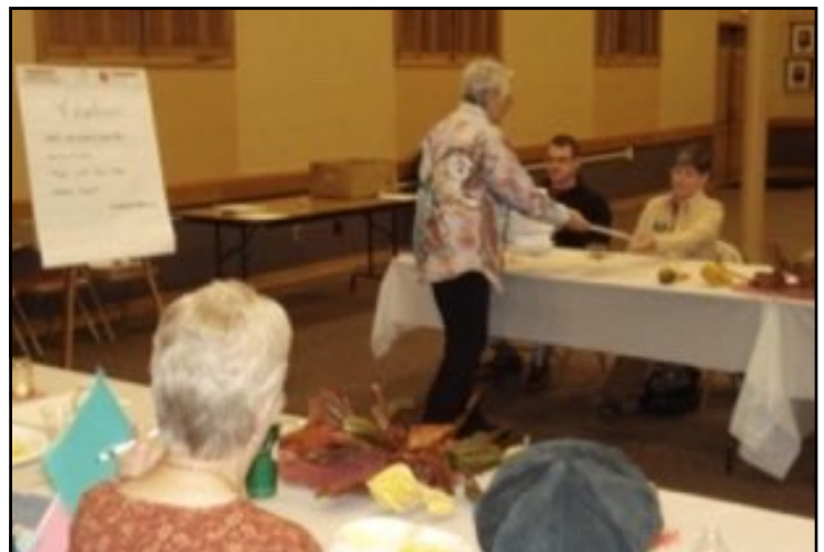
Mentors preparing for the 2015 class.